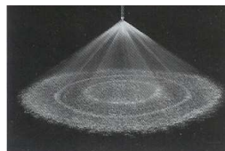
Full Cone 150 / 170°