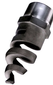
60°, 90°, 120° metal

The TF spiral full cone nozzle is highly energy efficient with a high discharge velocity. It is a one-piece construction with no internal parts, and is clog resistant. It is available with a wide range of flow rates and spray angles. It is used for cooling, dust control, fire protection, humidification, and fogging & misting.