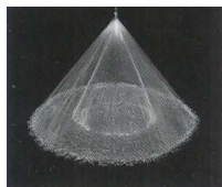
Full Cone 60°