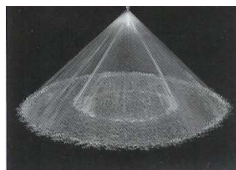
Full Cone 90°